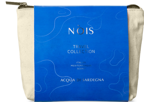
Ko85AS containing: P100BLAS, P100BAS, P100SAS, P100CAS, B182oAS

SHOWER GEL Italian Mediterranea Scent WITH MYRTLE