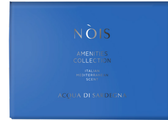
CAMP2AS containing: P52BLAS, P52BAS, P52SAS, P52CAS, B182oAS