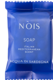
B182oAS 20 g e 0,67 Net wt oz